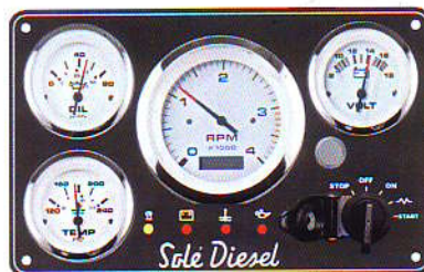
Standard Panel (250 x 150 mm)

SOLÉ, S.A. Ctra. de Martorell a Gelida, km 2 08760 Martorell (Barcelona) Tel. 93 775 14 00 - Fax. 93 775 30 13 Tel. Recambios 93 775 44 05