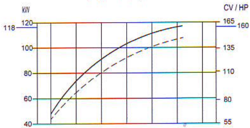
Potencia - Power